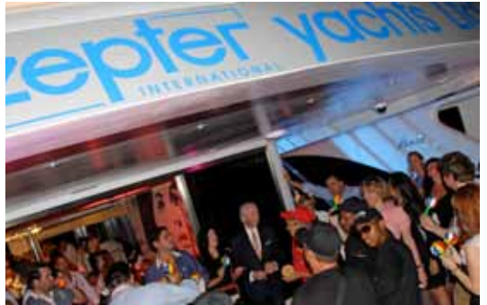
The Zepter party in full swing.