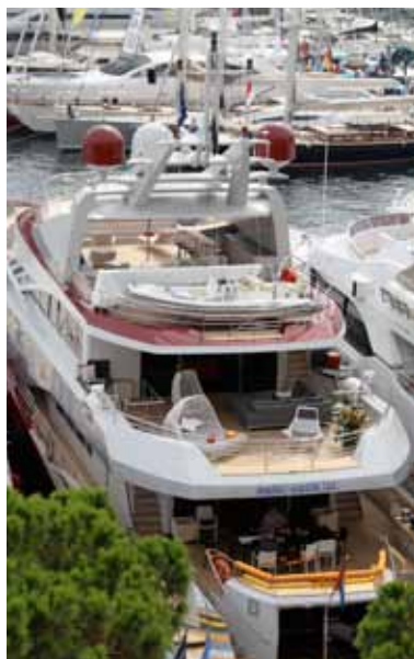
'joyMe was the centre of attention in Monaco.