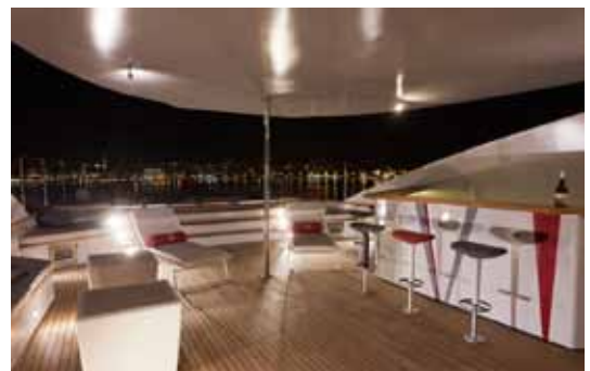
The Sun deck is the perfect place to socialise and enjoy the outdoors.