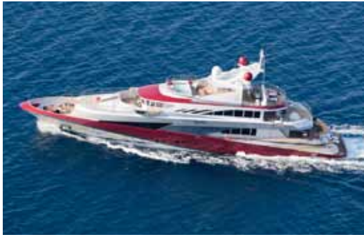
'joyMe's exuberant exterior sets it apart from other yachts.