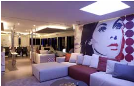
The Main deck boasts wide open spaces for an inclusive effect.