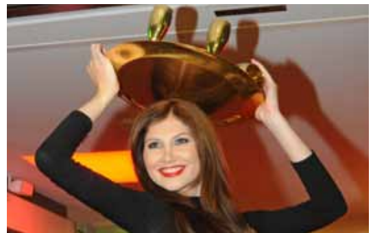
Zepter Masterpiece Collection in gold is always in fashion.