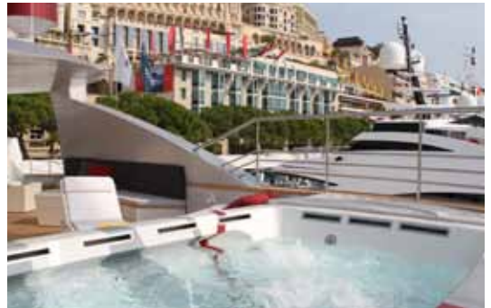
The glamorous open air pool against the backdrop of beautiful Monaco.