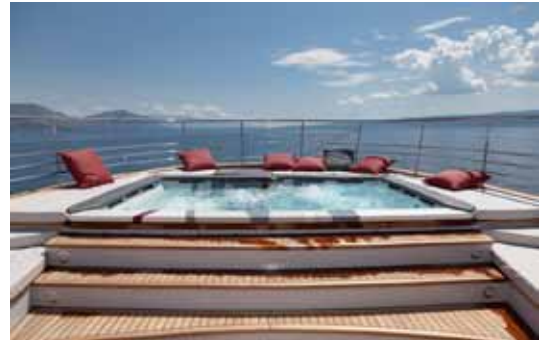
The pool is the perfect setting to relax either under the blue sky or under the stars.