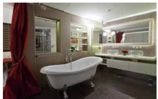
The elegant Master bathroom is not what you would expect to find on a yacht.