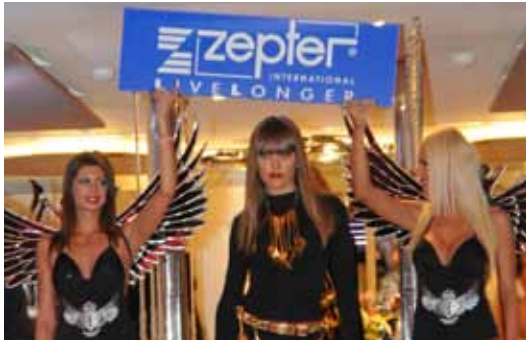
The Zepter Golden Age Collection adorns the catwalk on board 'joyMe.