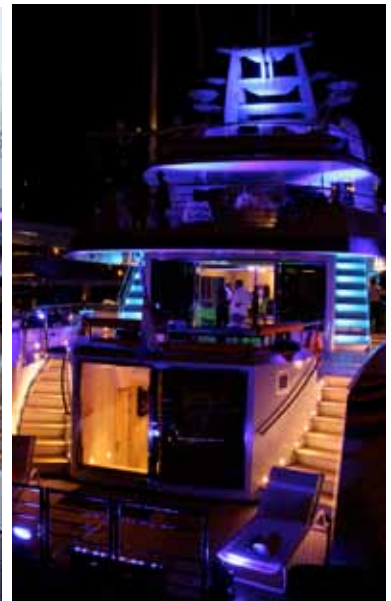
'joyMe by night.