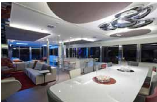
The Dining area brings people together in a modern, spacious ambience.