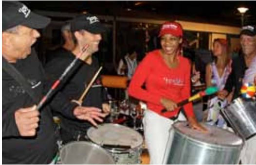
Tropical sounds from Brazilian drummers turn up the heat.