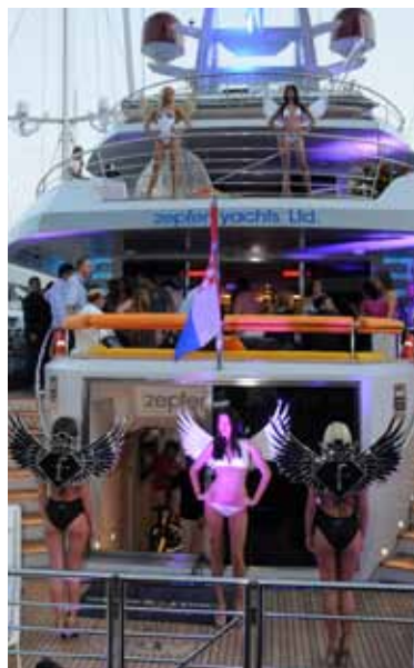
Welcome on board.